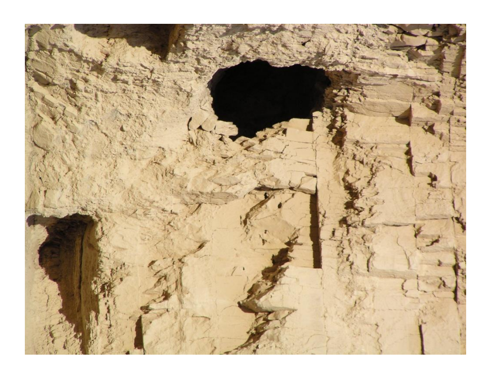
MORE CAVES AT EN GEDI