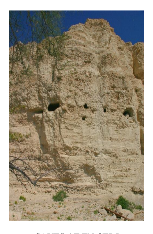
CAVES AT EN GEDI