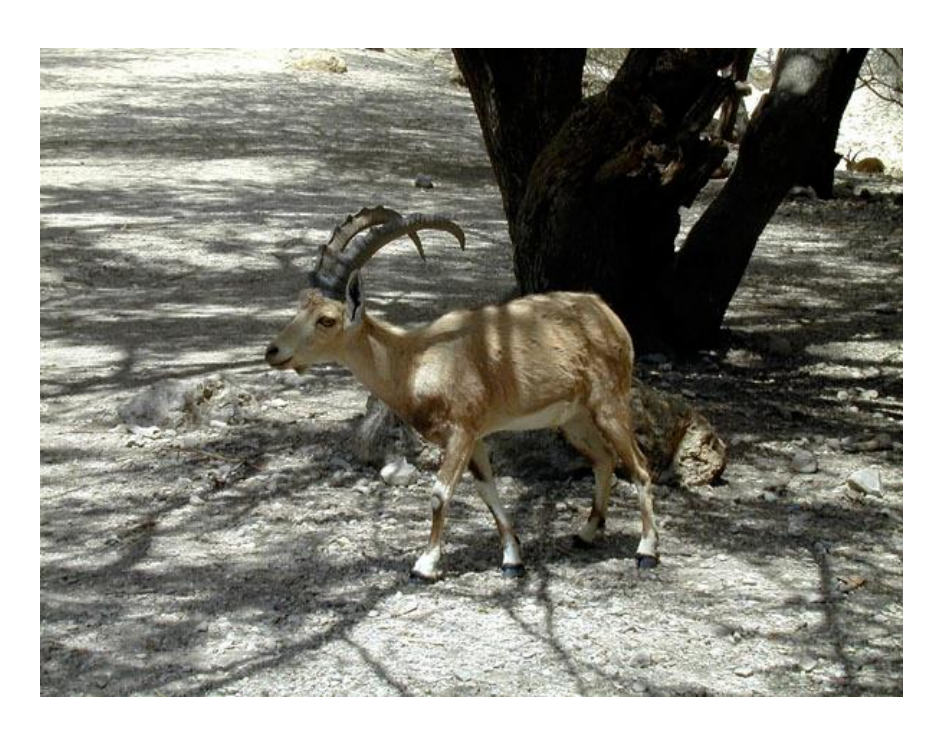
IBEX OR WILD GOATS AT EN GEDI