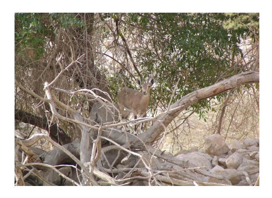
MORE IBEX OR WILD GOATS AT EN GEDI