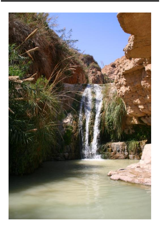
WATERFALL AT EN GEDI