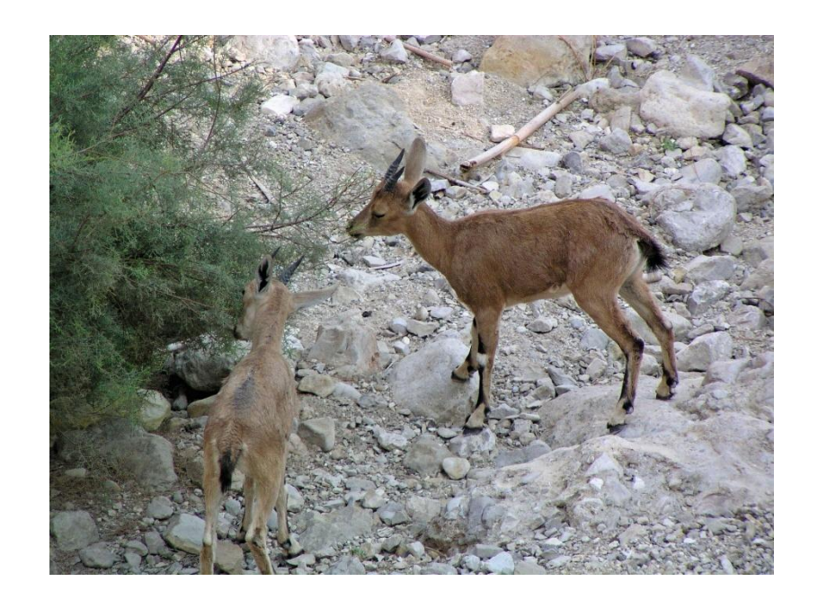
MORE IBEX OR WILD GOATS AT EN GEDI