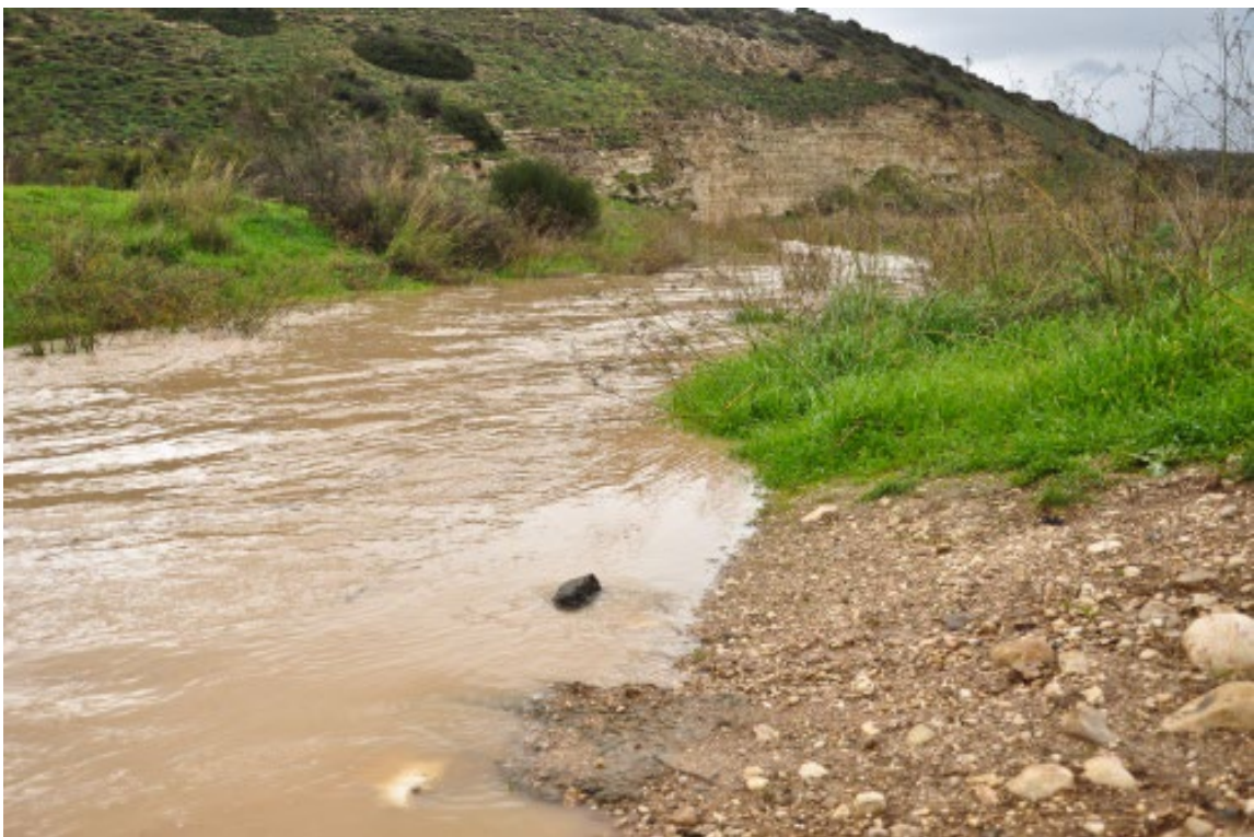
Valley of Elah during a January storm! It is normally dry!