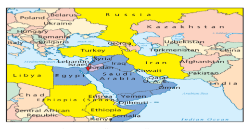
Nations named in Gog's Alliance - yellow Nations not named in Gog's Alliance - blue

Here in Ezekiel we see Russia and these Islamic nations coming down to destroy Israel. In this it seems that Russia is drawn into this battle, maybe because of the alliances that it has made with these Muslim nations. Also, because of the huge gas and oil deposits they have found in Israel. God puts His hooks in their jaw and draws them into this battle.