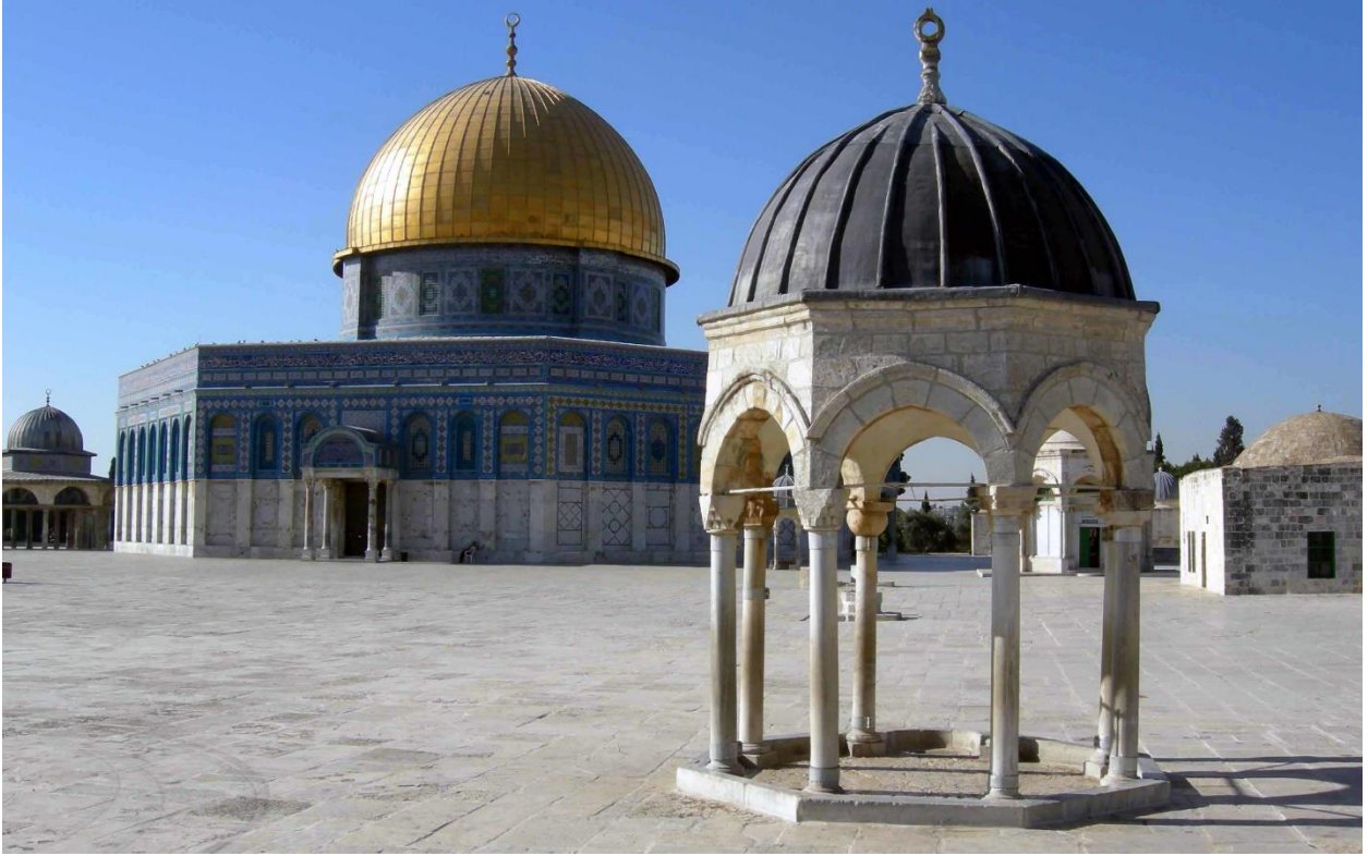
Dome of the Spirits or the Dome of the Tablets with the Dome of the Rock in the background.