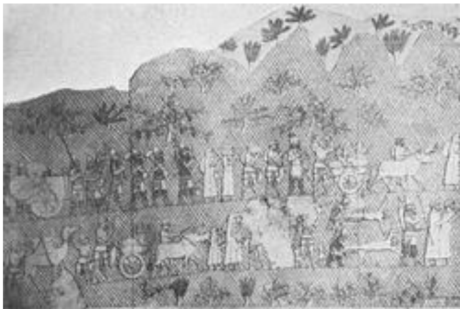
Judean captives being led away into slavery by the Assyrians after the siege of Lachish in 701 B. C.